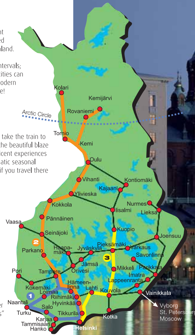
Helsinki by night. ►

The scenic trip to Kuopio is No. 3 on the map.