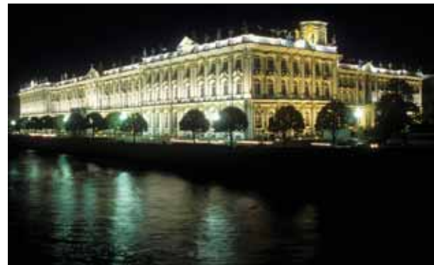
The Winter Palace located along the banks of the Neva is part of the Hermitage's extensive art museums.

On the Sibelius the personnel and restaurant are Finnish; on the Repin and Tolstoi they are Russian. In the restaurant you can concentrate on enjoying yourself; the sleeping cars enable you to relax and arrive at your destination well rested.