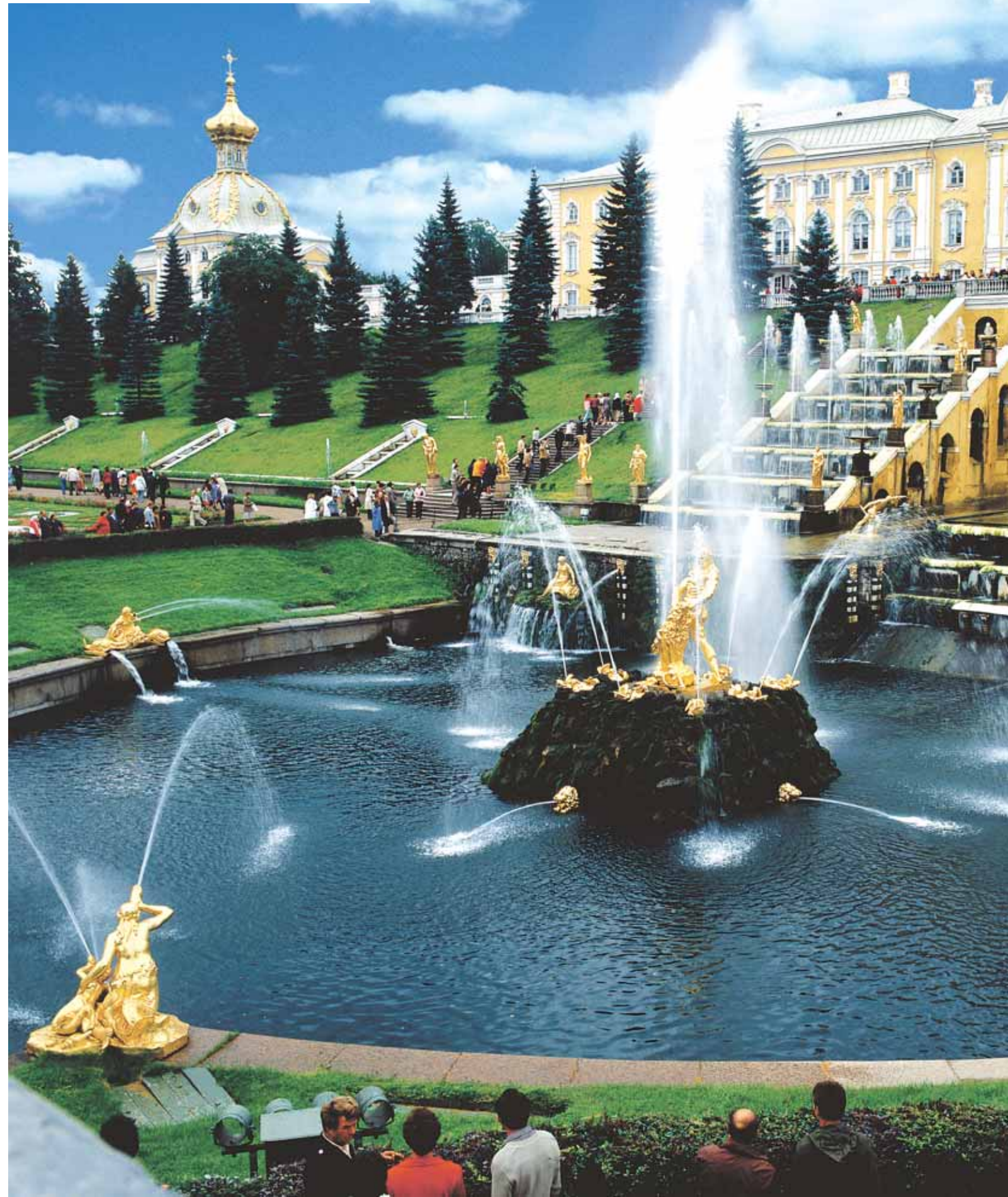
Peterhof outside St. Petersburg.

Moscow has internationalised rapidly in recent years; you will find breathtakingly beautiful onion-domed churches, monuments from the Soviet era, as well as modern business hotels. Any visitor to Moscow must see Red Square, the Kremlin and the Tretjakov Art Gallery. The city also offers virtually unlimited possibilities for shopping, dining at countless high-quality restaurants, and a lively nightlife.